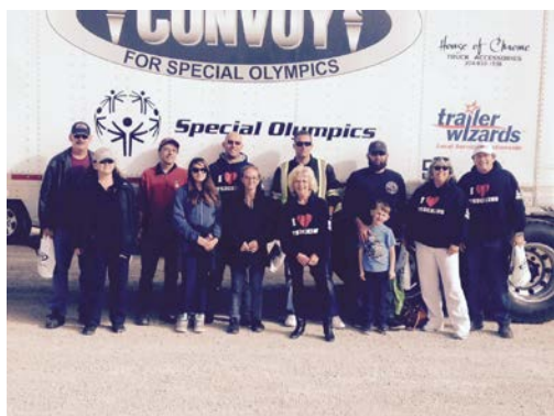
Convoy participants for Special Olympics 2011, 2012, 2013, 2014, 2015